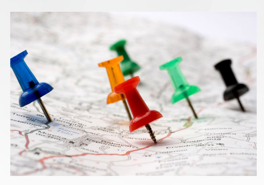
messageinadrawing.com/wp-content/uploads/Cartoon How-to-start marijke.jpg